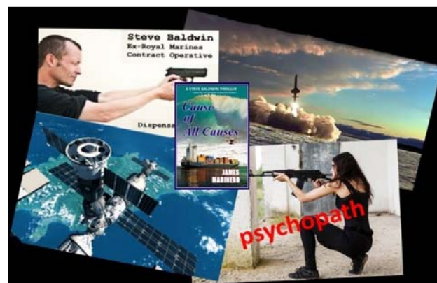
'Cause of All Causes' Action Sequence Image with the main characters, missile launch and satellite flypast.

This profound experience is vivid in his writing. His latest novel 'Cause of All Causes' is a technothriller in every sense of the word and completes his 'Maghreb Trilogy' of escalating Islamist terrorism attacks which threaten the West with global-scale disaster.